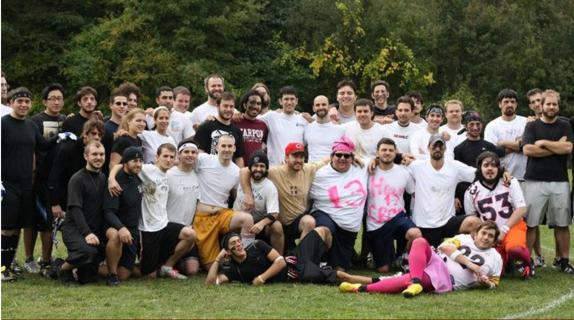
Participants in the annual HC/HC Columbus Day football game gather in good spirits for a post-game photo.